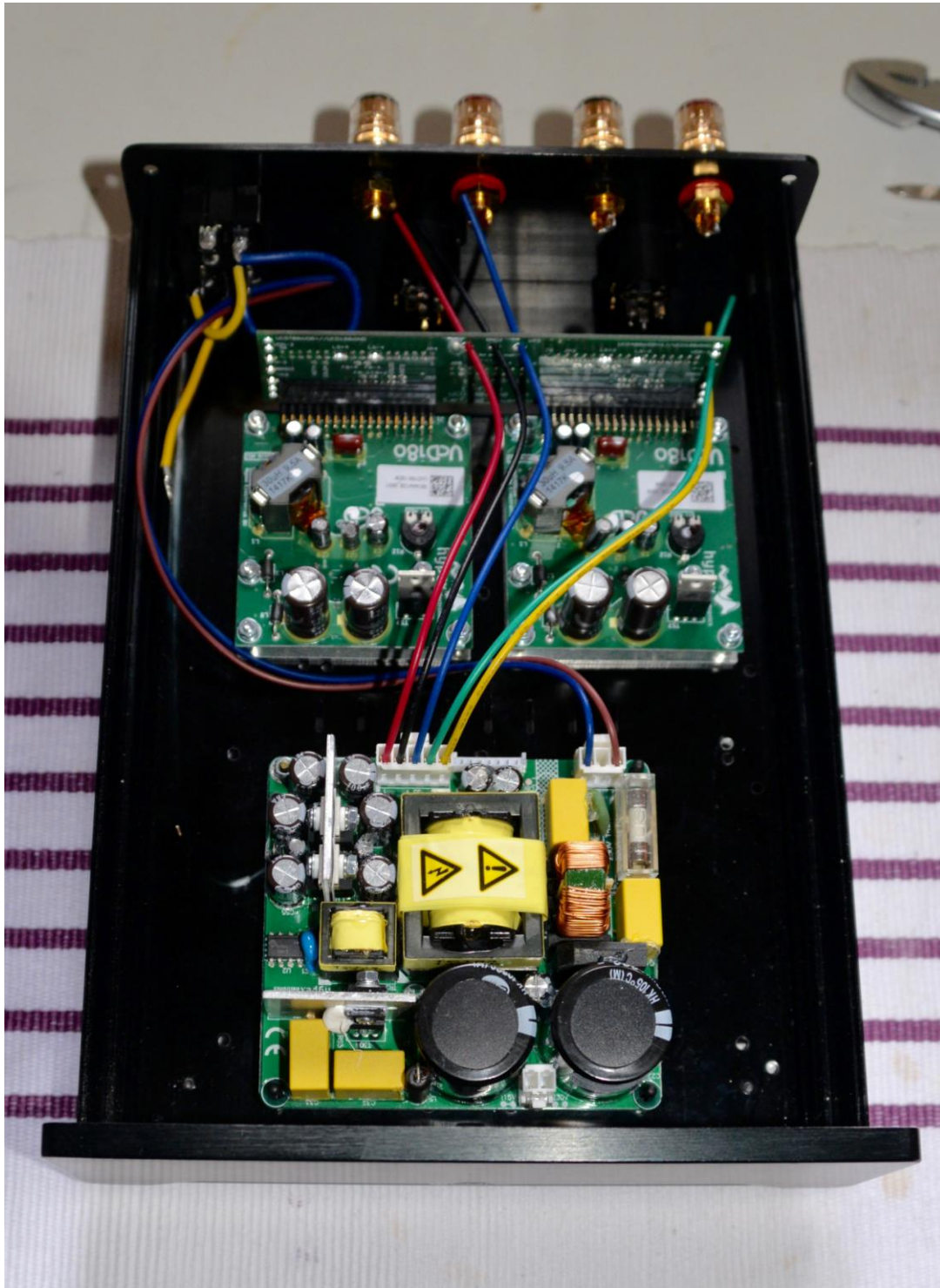
Example of a Stereo Amplifier with UCD180OEM modules and SMPS400A180 power supply